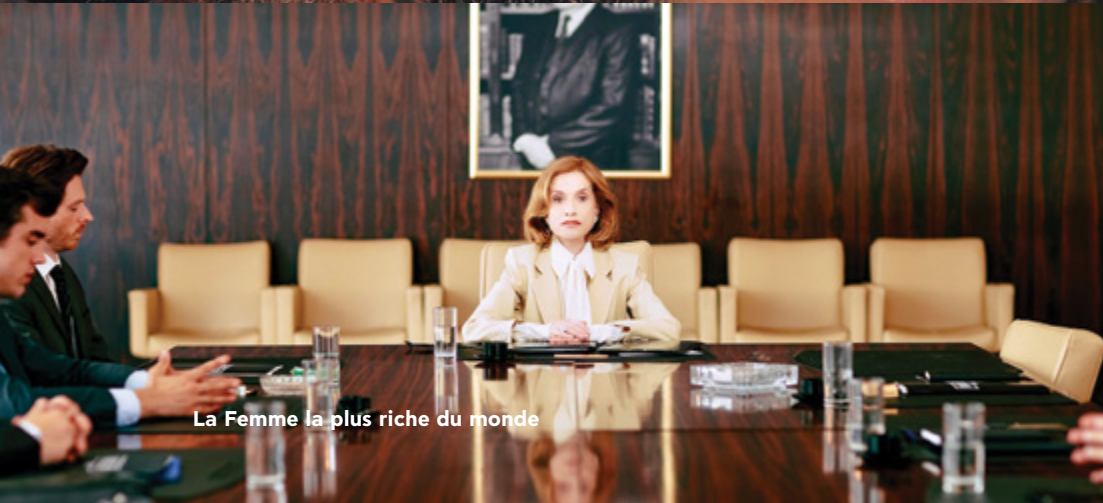
La Femme la plus riche du monde