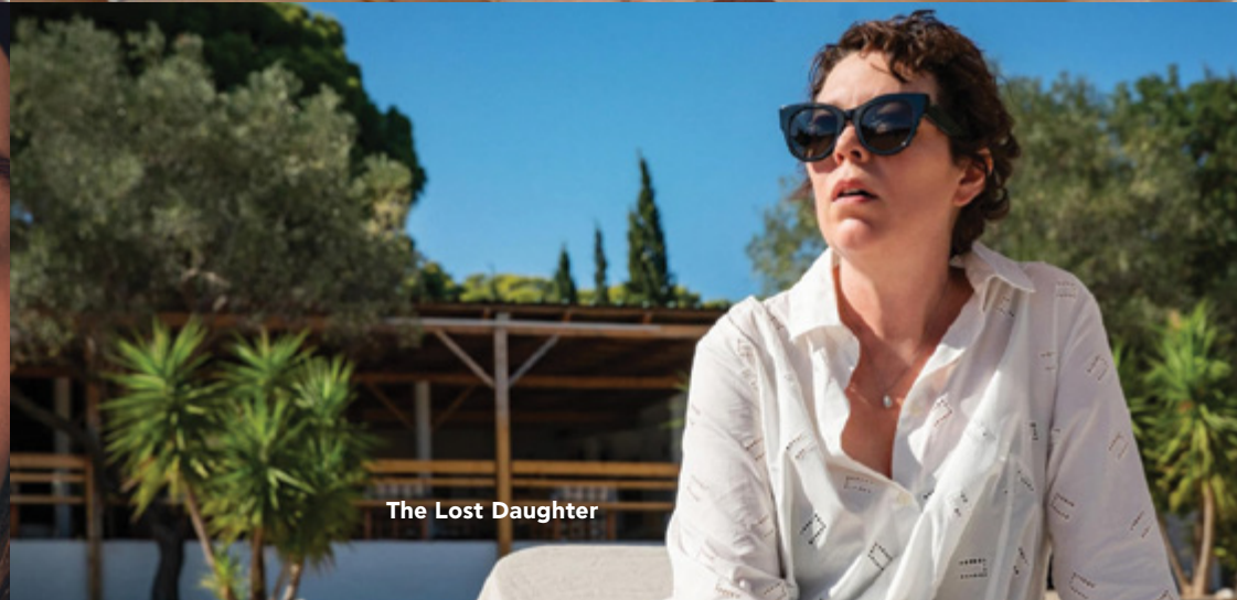
The Lost Daughter