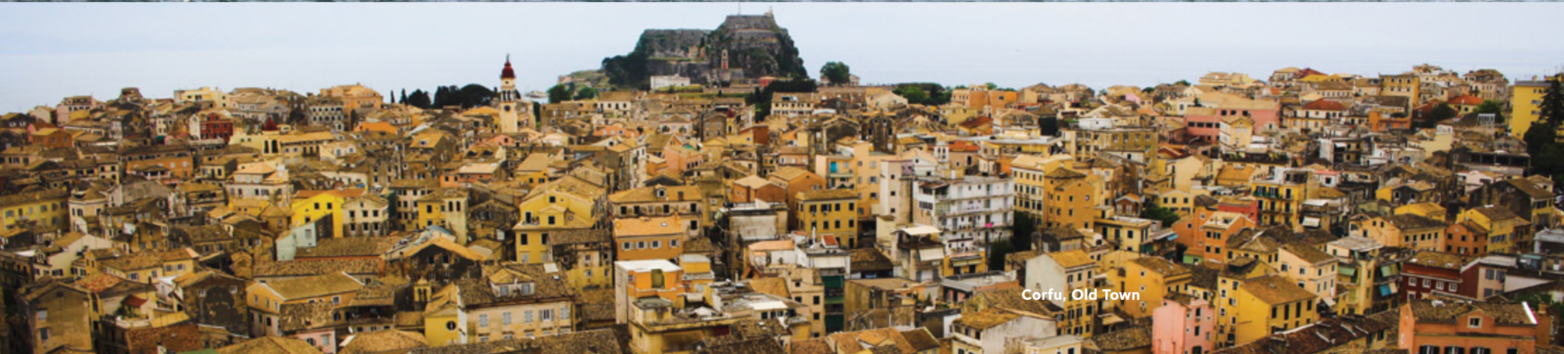
Corfu, Old Town