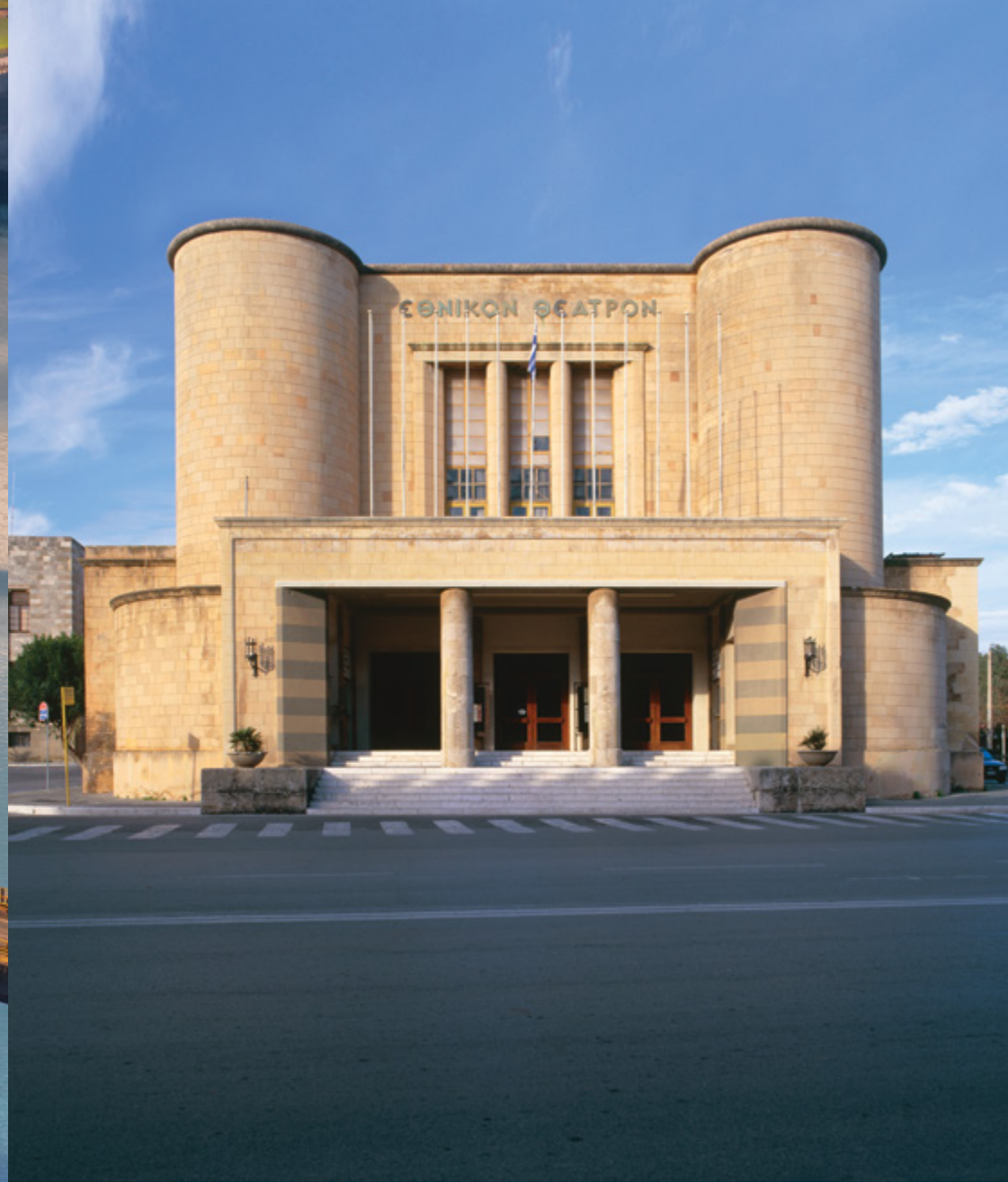
National Theatre, Rhodes