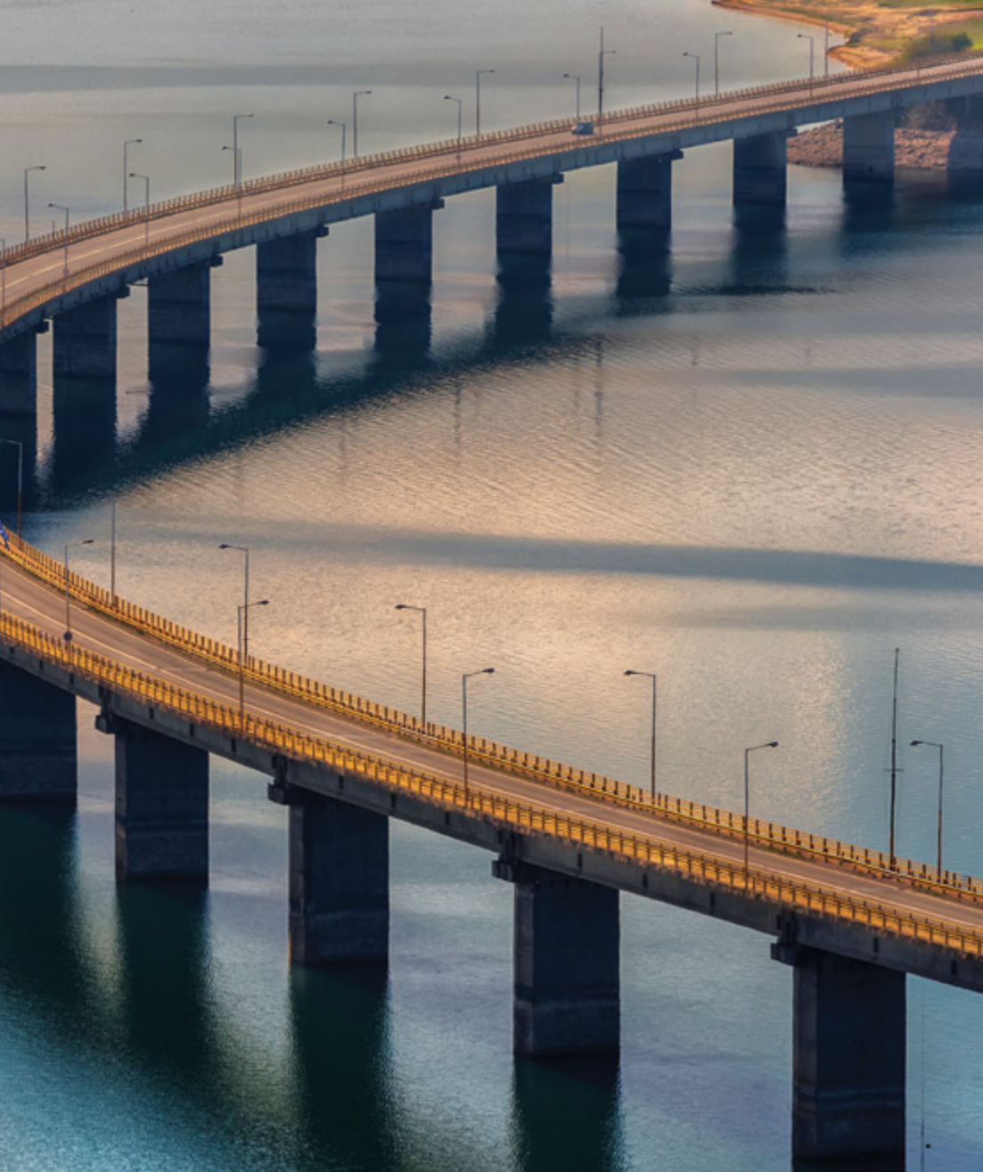
Servia Bridge, Kozani