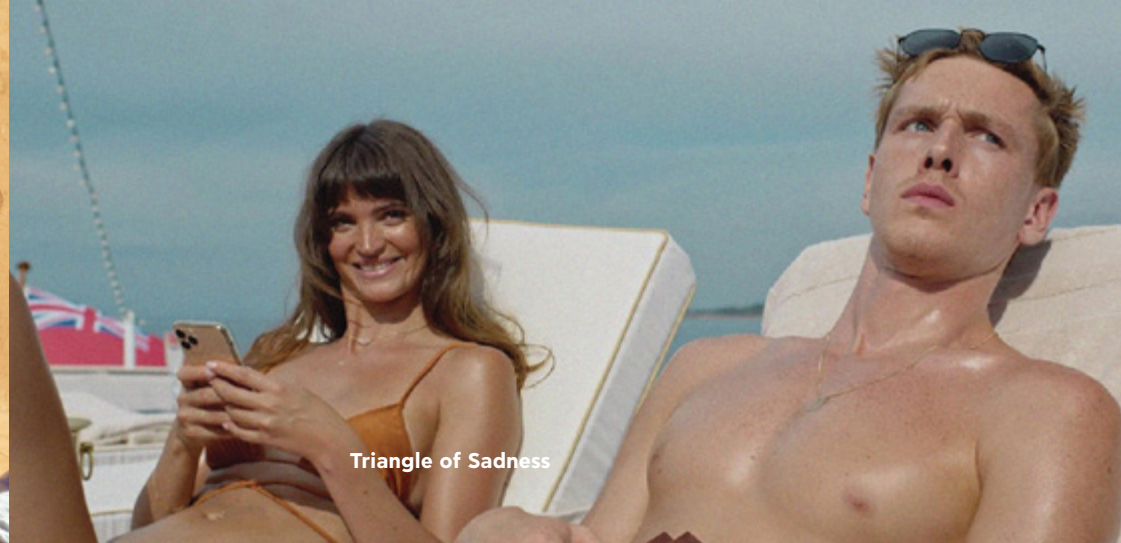
Triangle of Sadness