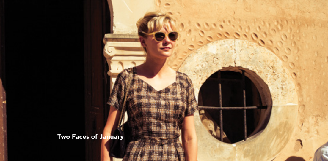
Two Faces of January