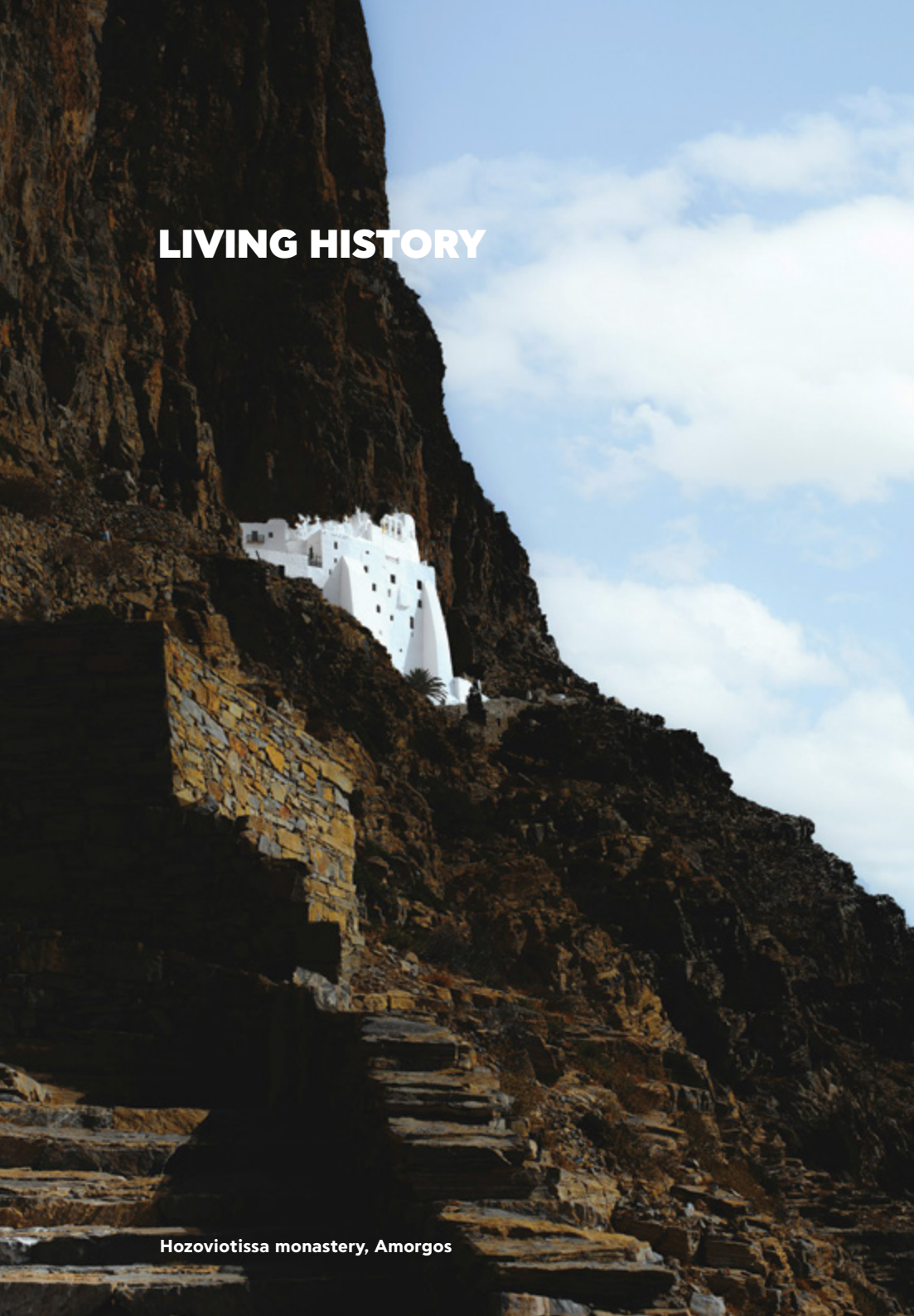
Hozoviotissa monastery, Amorgos