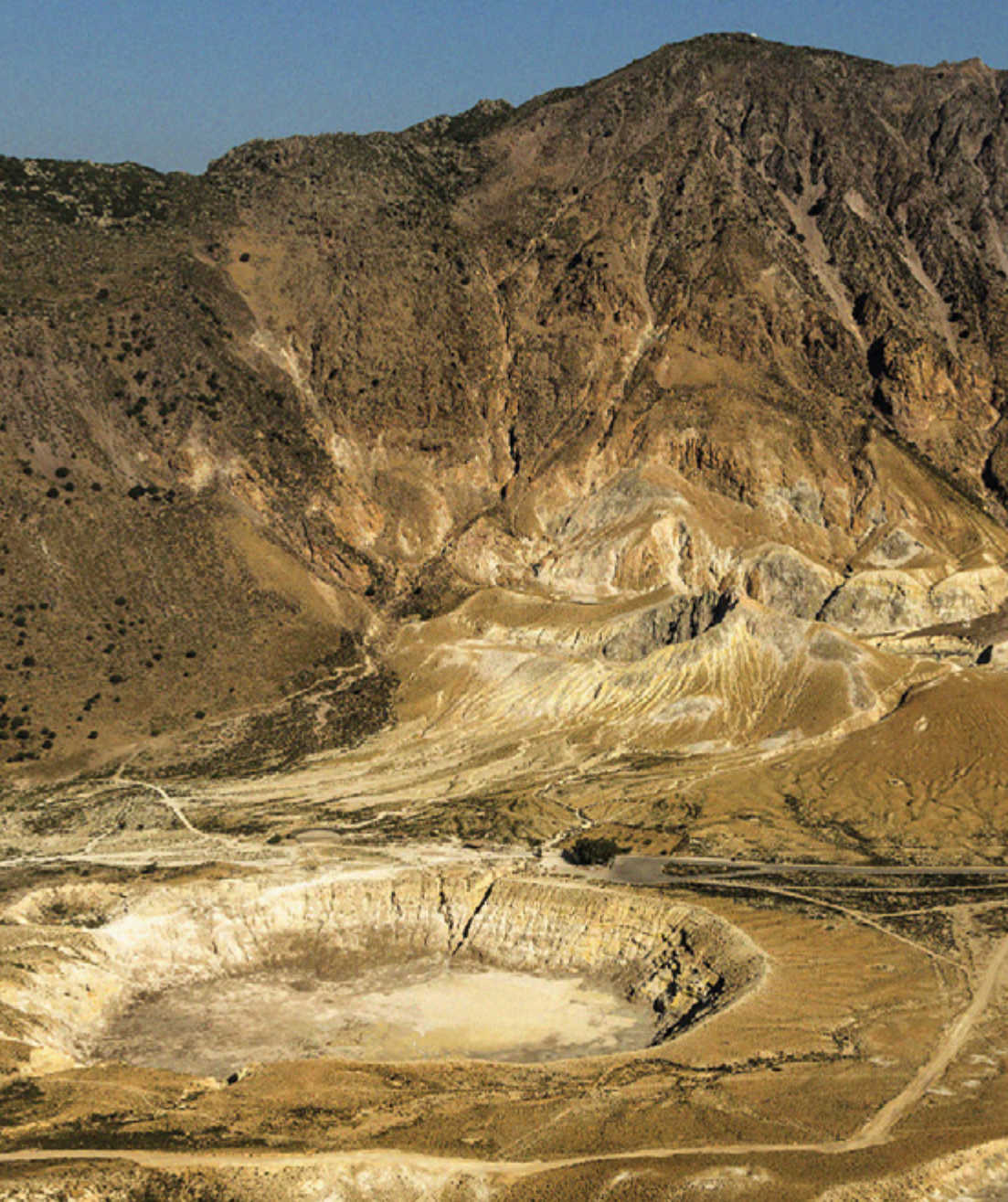
Active volcano, Nisyros